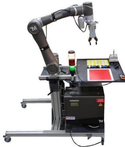
ON00: Omron TM5 Cobot & Vision Station with height-adjustable frame and removable tray