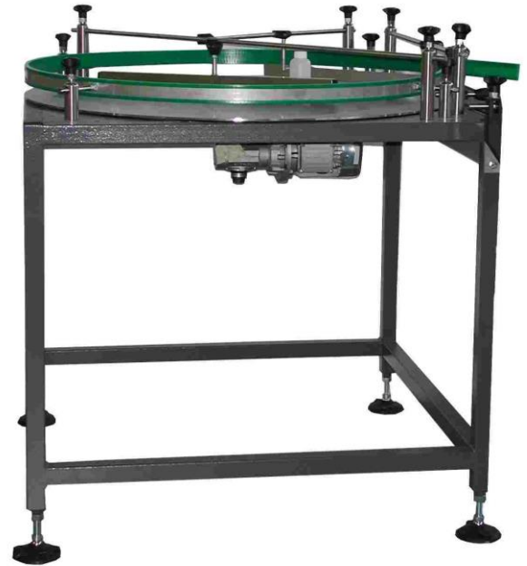
Stainless steel rotary accumulation table with a diameter of 1 m