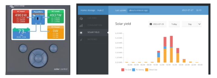
Data acquisition system with display example